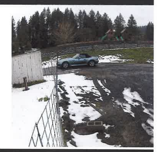
side drive Feb 28, 2023 at 8:49 AM