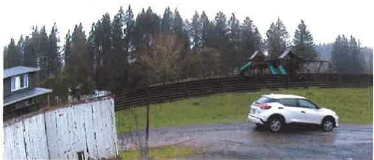
side drive Mar 9, 2023 at 10:28 AM