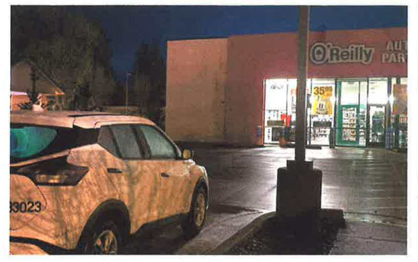
side drive Mar 9, 2023 at 4:42 PM