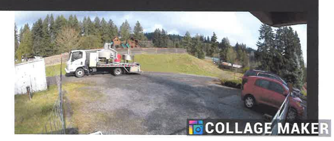
side drive Feb 10, 2023 at 12:26 PM

The volume of traffic alone constitutes commercial/ industrial. By the counties own definition this is grounds for denial.