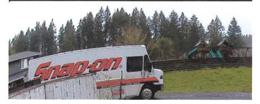
Here are examples of deliveries. Over the allowed permit amount. And after the cease and desist.