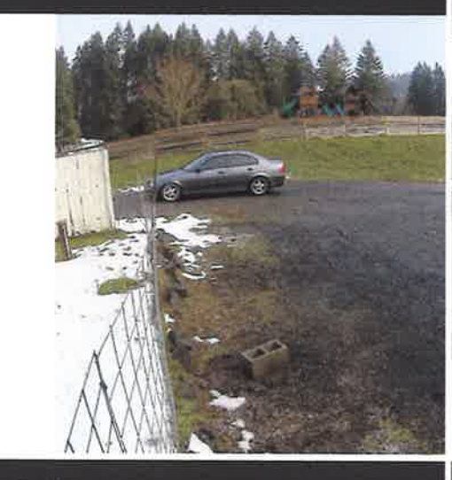
side drive Mar 1, 2023 at 10:53 AM