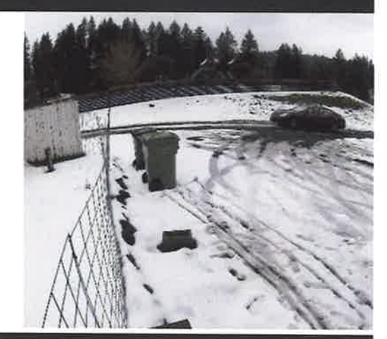
side drive Feb 21, 2023 at 8:47 AM