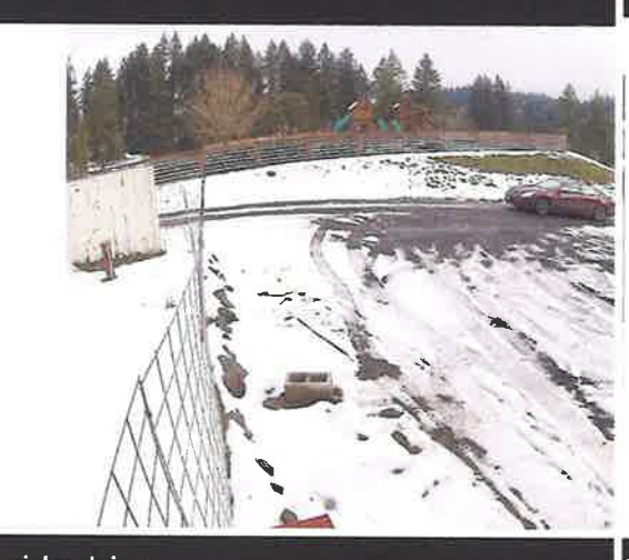
side drive Feb 22, 2023 at 8:08 AM